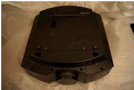
M5 Screws with spacers for Sony projectors.