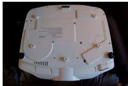
M4 Screws for Epson projectors